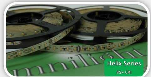
Helix Series 85+ CRI

24VDC Flexible, Interior Standard & High Output LED Interior Ribbon. 85+ CRI. The benchmark for Architectural grade LED Ribbon.